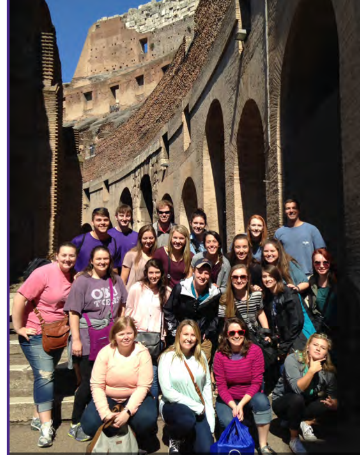
The European Study Tour group visited the Colosseum in Rome.

This year's theme was "East Meets West." In addition to the diverse cuisine, participants enjoyed a variety of music genres as several international students performed songs from their homelands.