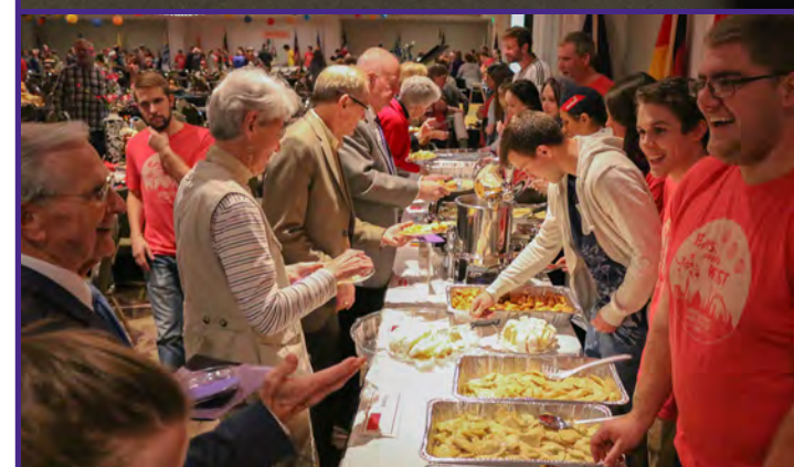
More than 600 faculty, staff, students and guests participated in the 2016 International Food Festival in Walker Conference Center.